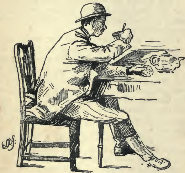
DRINKING STRONG TEA AND EATING BUNS WITH SERIOUS SIMPLICITY

"You're the very man I wanted to see," I said as I sat down beside him at the oilcloth-covered table; "a man I know in England who is not much of a judge of character has asked me to buy him a four-year-old down here, and as I should